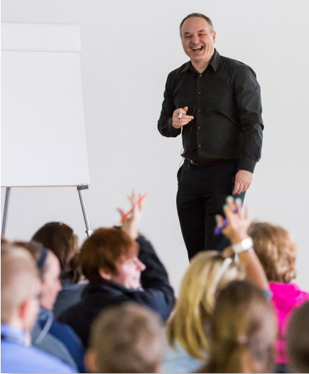
The 2016 Conference

Annual 2017 Conference Sponsorship Opportunities